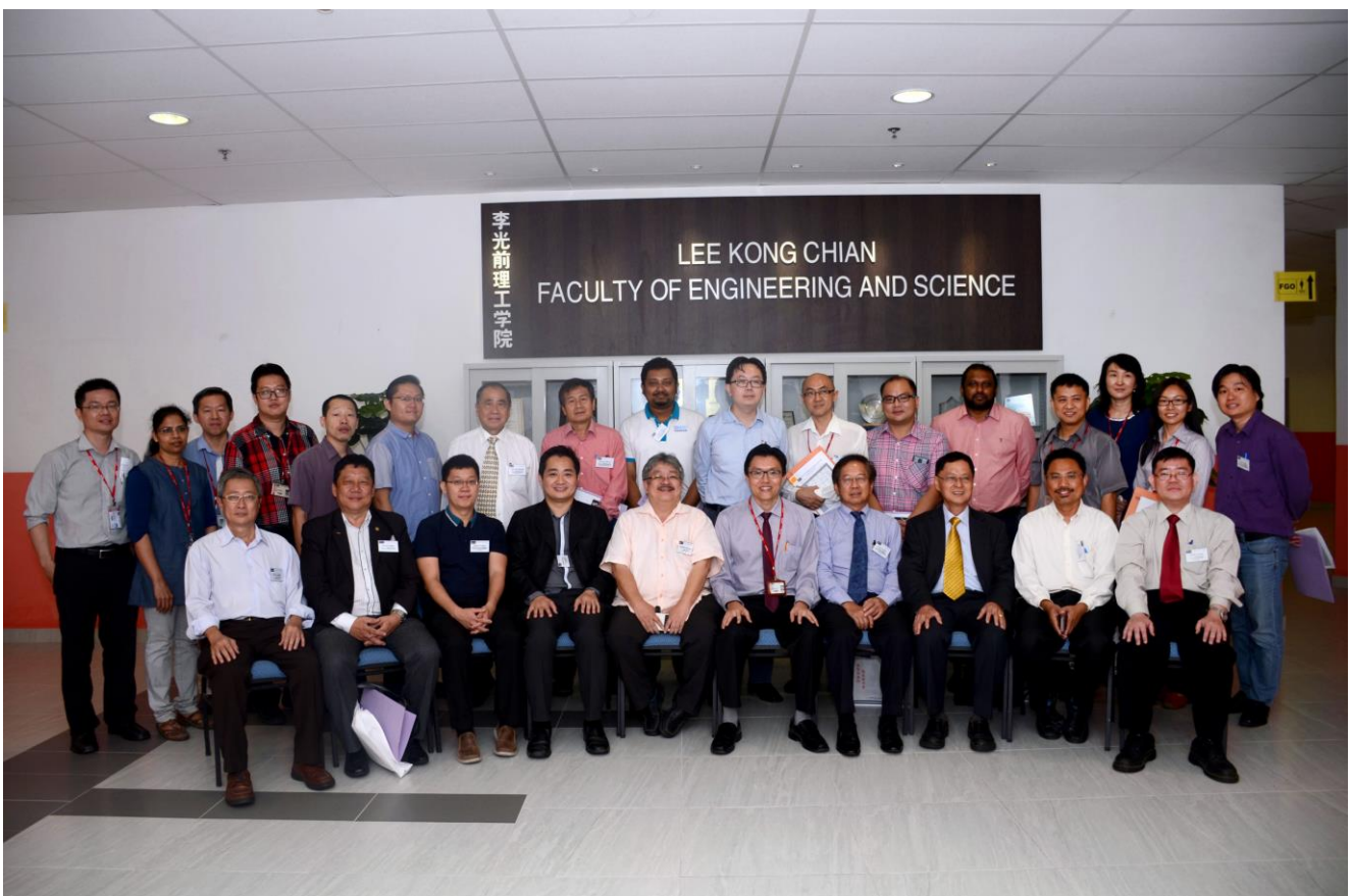
The team of IAP members and faculty members

The winners walked away with RM250 cash, souvenirs and certificates, while the first runner-ups received RM150 cash and certificates whereas, the second runner-ups took home RM100 as well as certificates. Certificates were also awarded to the remaining Top 40 posters.