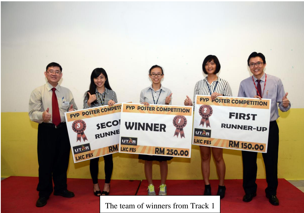
The team of winners from Track 1