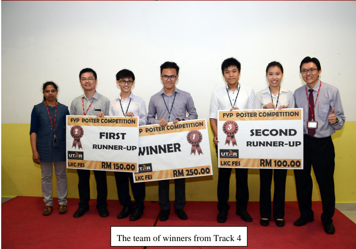
The team of winners from Track 4