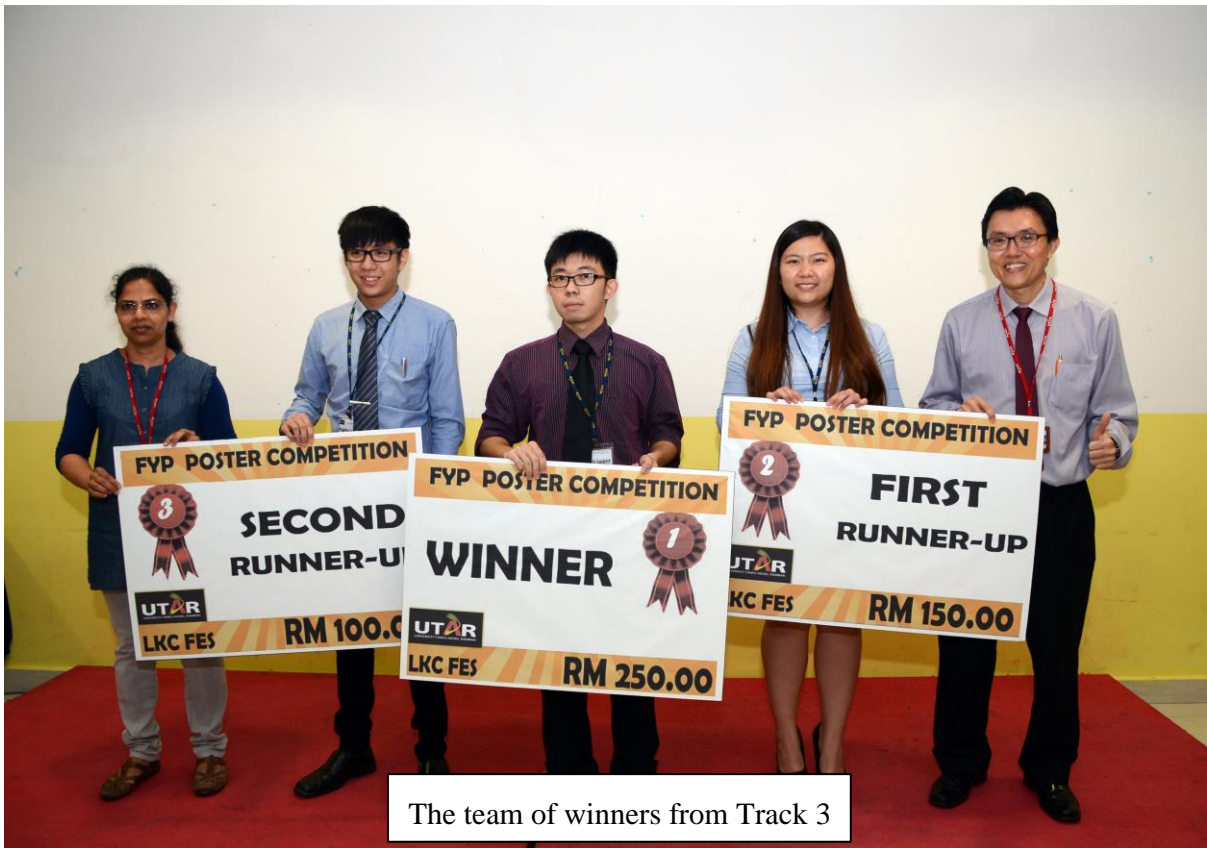
The team of winners from Track 3