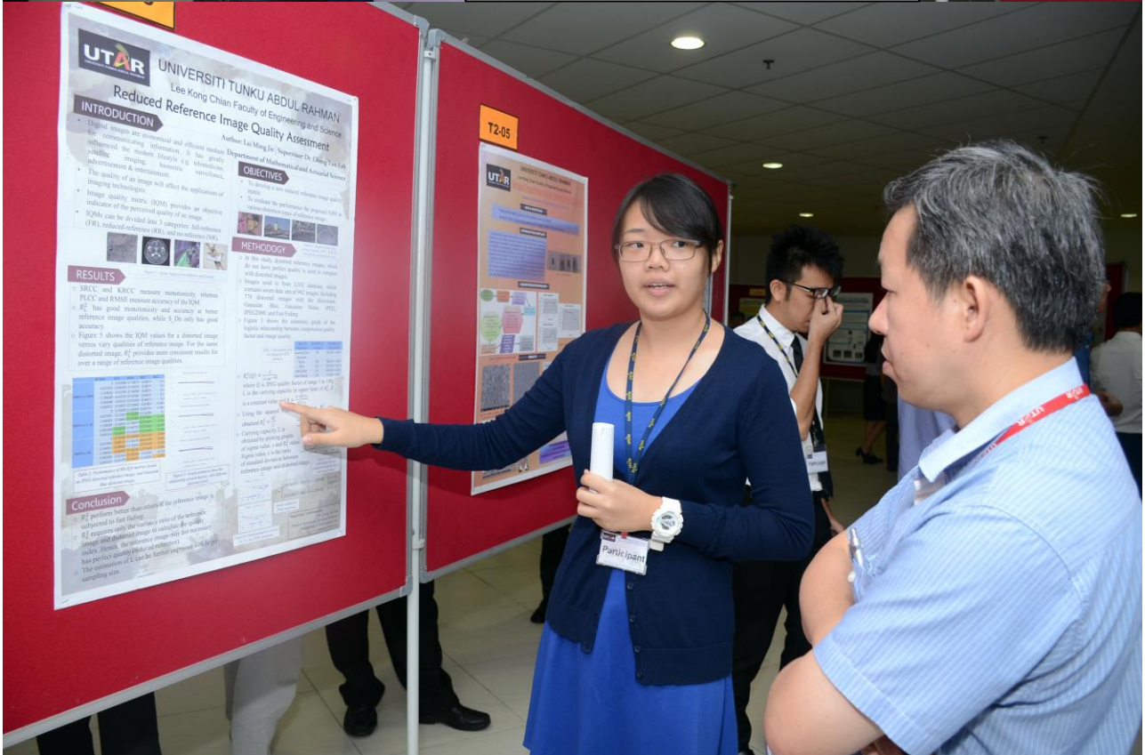
A contestant exhibiting her poster