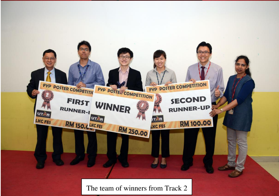
The team of winners from Track 2